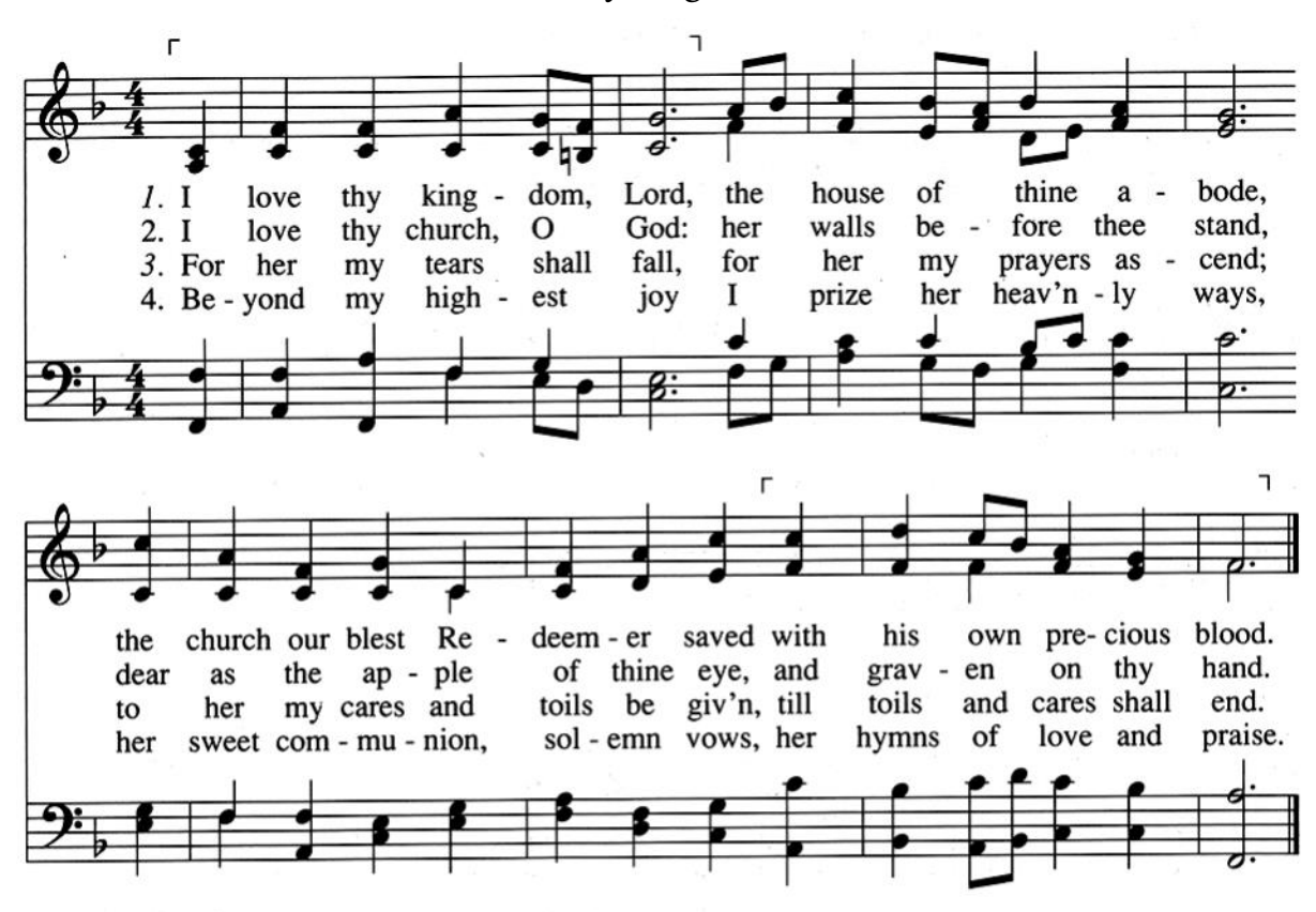
I Love Thy Kingdom, Lord

5. Jesus, thou Friend divine, our Savior and our King, thy hand from ev'ry snare and foe shall great deliv'rance bring.